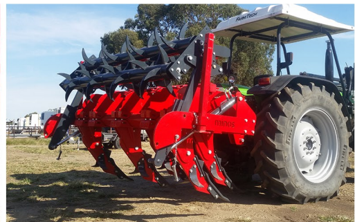
FOLDS FOR TRANSPORT