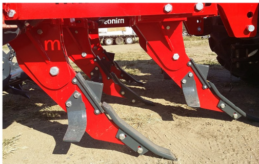
AGGRESSIVE RIPPER TINES