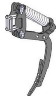
Tine with narrow coulter