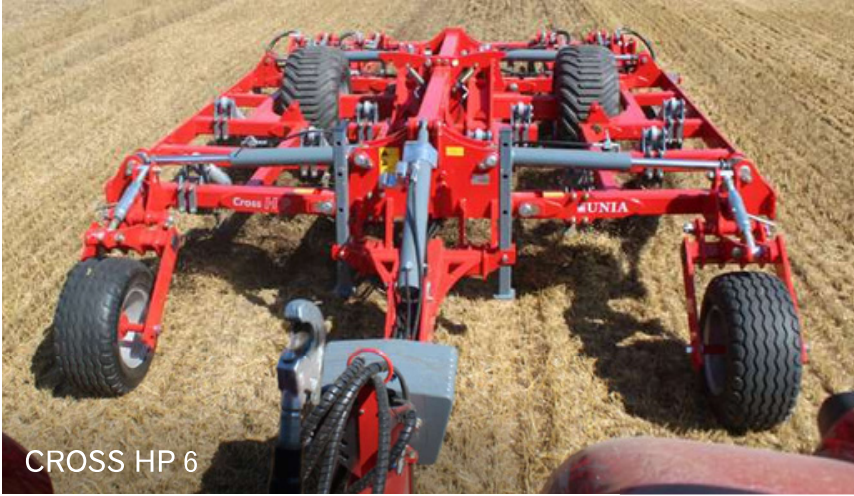
CROSS HP 6