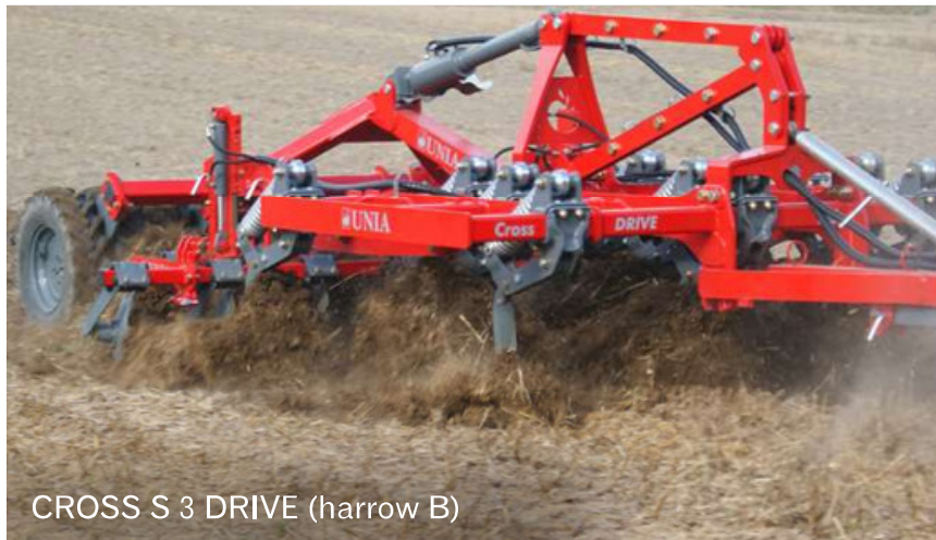
CROSS S 3 DRIVE (harrow B)