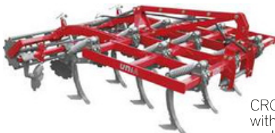
CROSS S mounted with pipe roller and harrow A

rollers acc. to table ROLLER LIST (page 45–47)