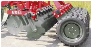
DRIVE system + harrow B